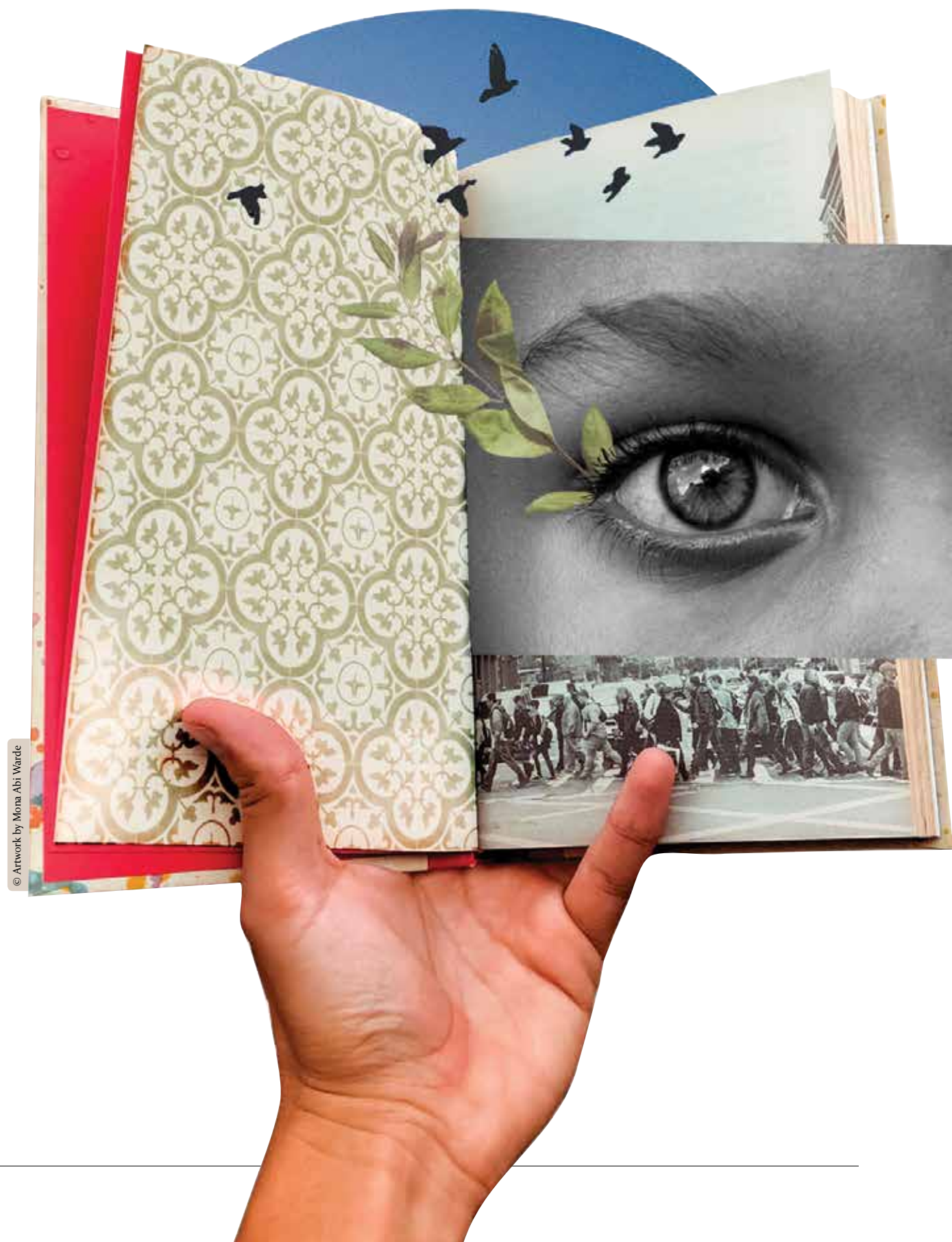
© Artwork by Mona Abi Warde

This four-year NAP will undoubtedly pave the way to a peaceful and stable Lebanon where peace and security are strengthened by women's increased engagement in politics, security and defense, as well as in mediation and peace negotiations; where gender-equality is reached by providing women and men with perfectly equal rights and opportunities.