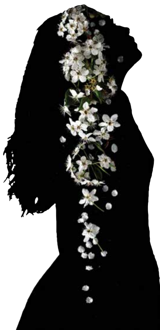
© Artwork by Mona Abi Warde

According to positive psychologist (6) , Dr. Zelana Montminy, the pursuit of any wishful thinking such as happiness or peace is elusive. The only path to true self-fulfillment requires being able to confront challenges as